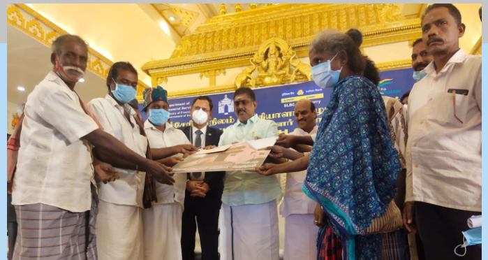
Home Minister of Puducherry distributed PMAY Pudhuvai Plus Loan to BLC Beneficiaries

The Jaga Mission a best practice adopted by the State of Odisha, has emerged as a torchbearer for the developing world by successfully demonstrating a programme transforming informal settlements and the lives of slum dwellers. So far, more than 1,75,000 slum families have been provided with land tenure security and 550 slums in 28 cities have been transformed into liveable habitats in Odisha.