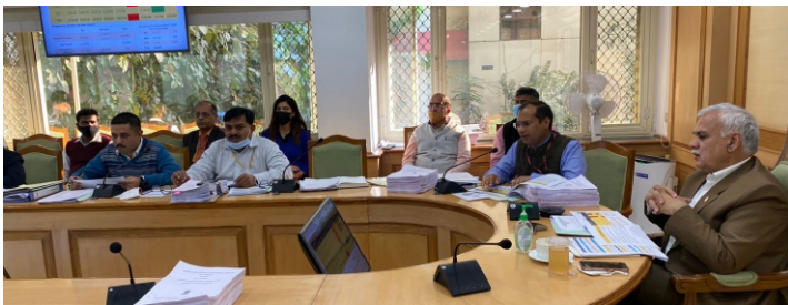
Secretary, MoHUA, & other officials attend 56th meeting of Central Sanctioning and Monitoring Committee (CSMC)

Presiding over the meeting, Secretary, MoHUA, took up the issues pertaining with States/UTs regarding construction of remaining houses under the Mission and asked the officials to resolve the issues without further delay so that construction of houses can be expedited.