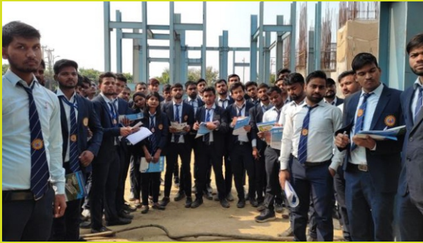
Engineering students during the Technograhis training at Lucknow LHP site

Another session for Technograhis was held in Rajkot, Gujarat, for 25 Civil Engineering Students of Marwadi University. They were briefed about the French technology- 'Monolithic Concrete Construction using Tunnel Formwork' - which is being used for construction of 1,144 houses with allied infrastructure in Rajkot.