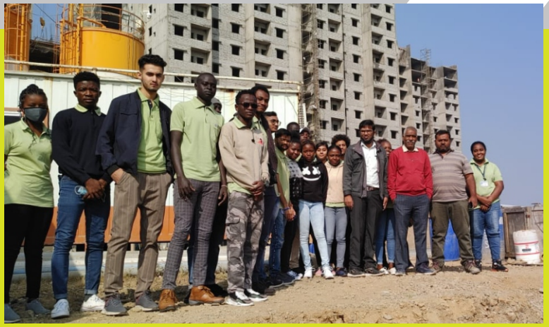
Engineering students during the Technograhis training at Rajkot LHP site

Two on-site training sessions were held in Lucknow, Uttar Pradesh, for Technograhis, where 50 students from Civil Engineering Department of Bansal Institute of Engineering and 53 students of R R Institute of Modern Polytechnic visited the Light House Project site in the